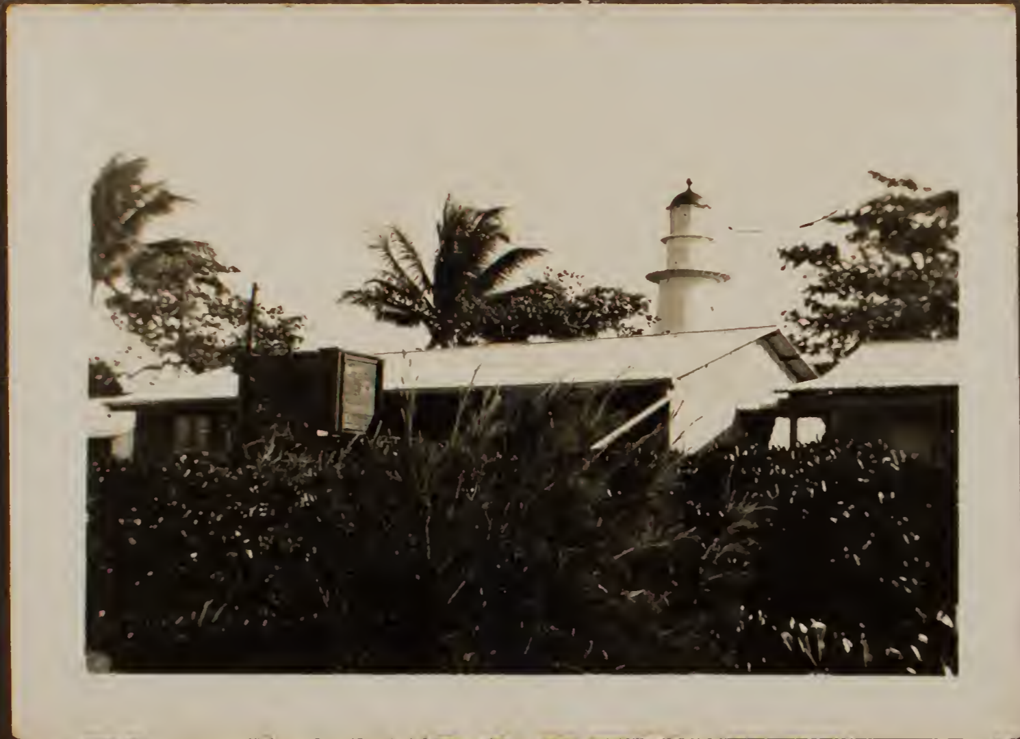
Laboratory & Saltwater Tank.